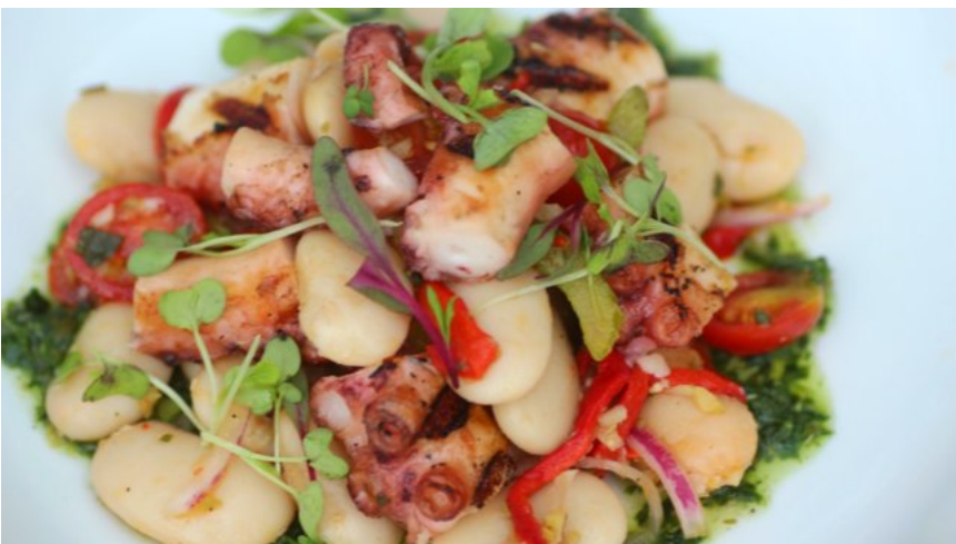
If cooked seafood is more your style, there's always the fire-roasted Spanish octopus with gigande beans, tomatoes, olives, and homemade salsa verde.