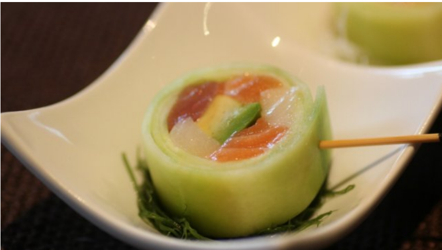
They'll be slicing fish and rolling it into stuff like this Lollipop Roll: salmon, avocado, and whitefish, wrapped in cucumber.